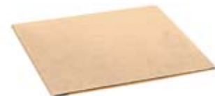
Paestum Cream & Gold Cover