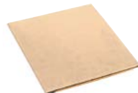
Paestum Cream & Gold Cover