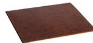
Pompeii Brown & Gold Cover