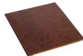
Pompeii Brown & Gold Cover