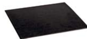
Napoli Black & Silver Cover