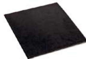
Napoli Black & Silver Cover